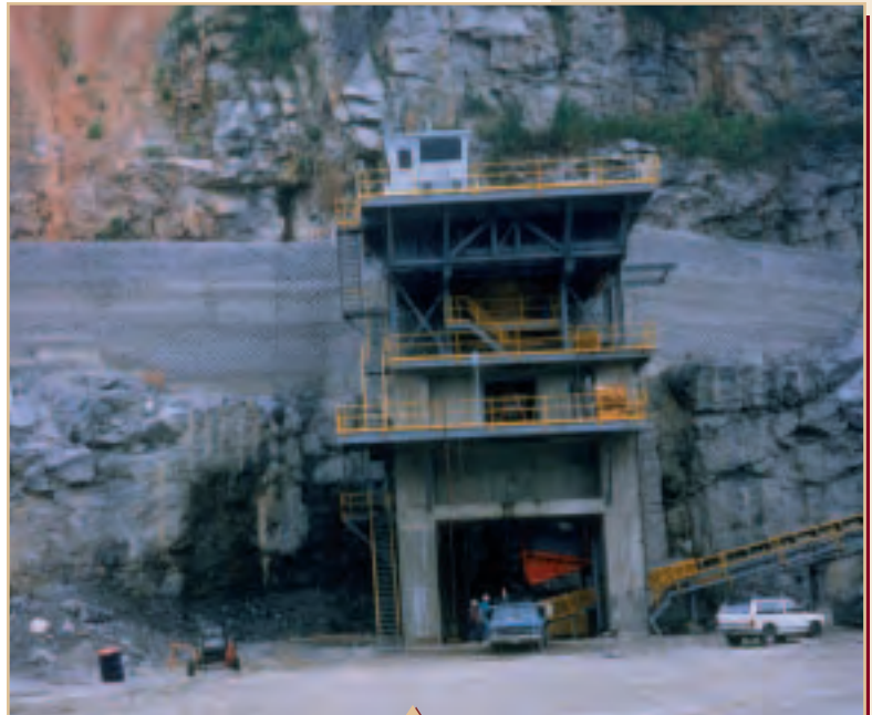
Rock quarry loading platform held with the Keystone Retaining Wall System