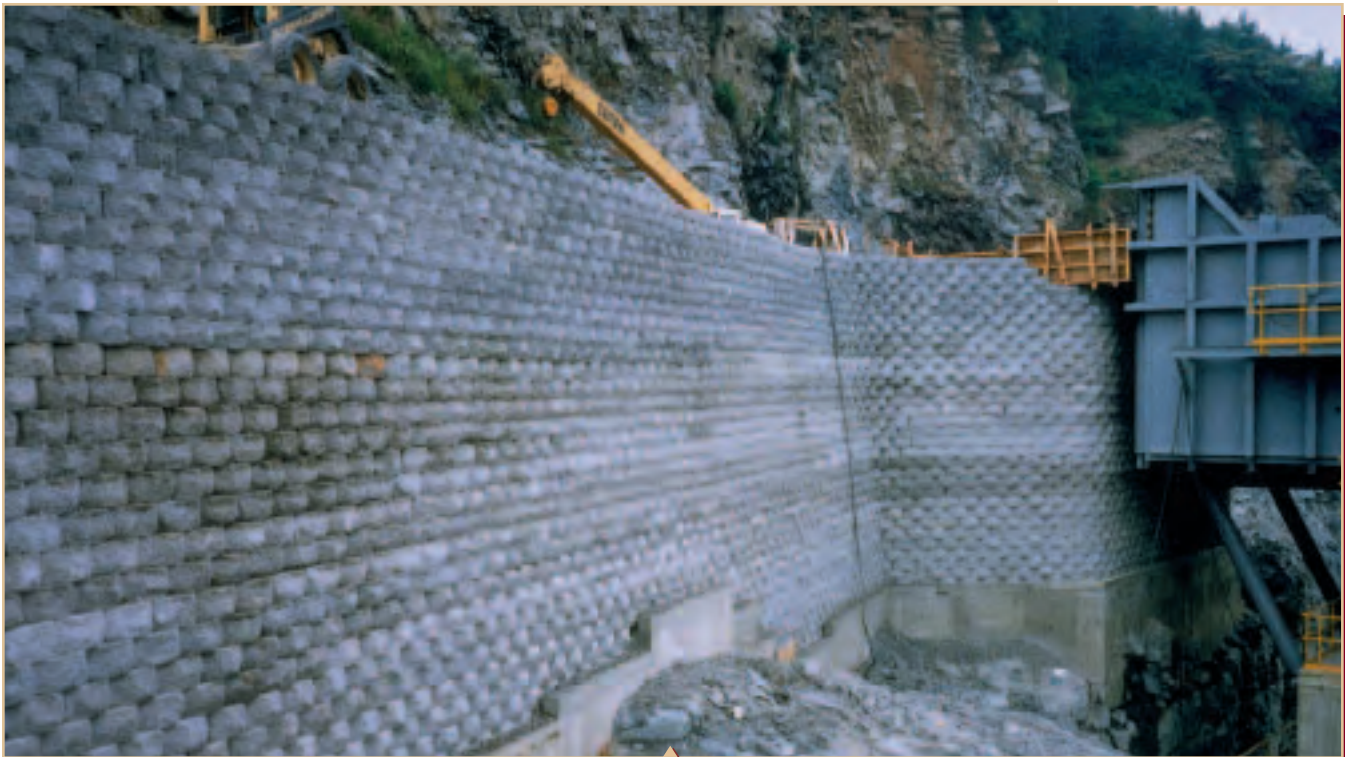
Keystone wall constructed on a reinforced concrete footing.